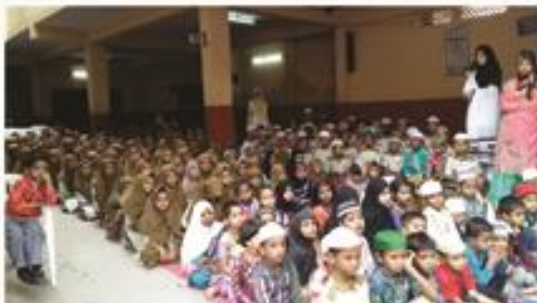
Annual day celebration at Mustafa Nagar