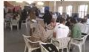
Medical Camp at Hasan Nagar