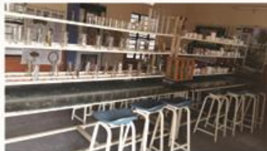
"Science Lab at Hasan Nagar"