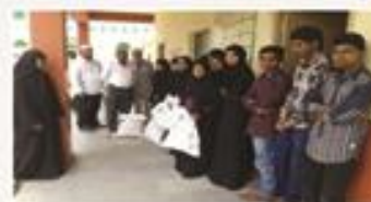
Distribution of grains at Hasan Nagar