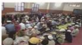
Hasan Nagar students at Iftar time