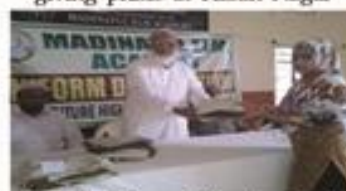
School Uniform Distribution At Hasan Nagar