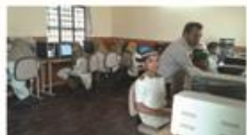
Students in the Computer Lab with Instructor at Mustafa Nagar