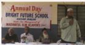
Annual Day at Hasan Nagar