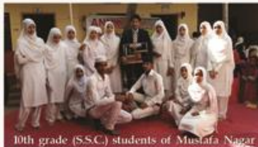
10th grade (SSC.) students of Mustafa Nagar