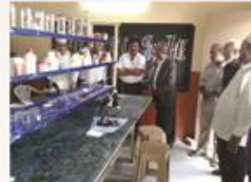
Renovation of Science Lab at Mustafa Nagar