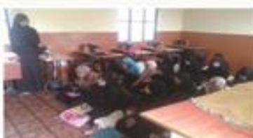
Students training at Tailoring Course at Hassan Nagar