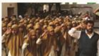
Republic Day at Hasan Nagar