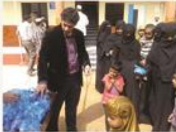
Chairman distributing snacks to parents at Mustafa Nagar